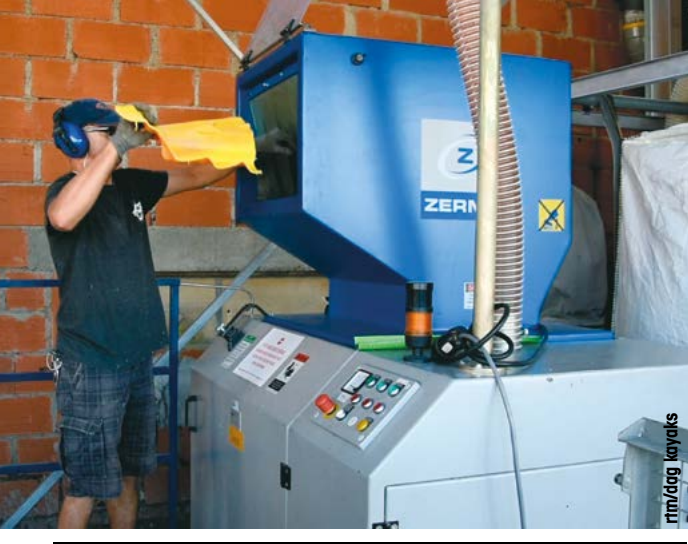
RTM & Dag Kayaks have been recycling old boats and platics wastes for some years now, as have others in the industry.

Further inspiration can be found in the success of ski giant Technica, which has collected and upcycled more than 4000 pairs of ski boots since launching the "Recycle Your Boots" program in 2021. Retailers played a crucial role in Tecnica's success by raising awareness of the campaign and collecting boots, later delivered to a collection center in Italy via a dedicated transportation system. The collected boots are broken down into useable raw materials and sent to different partners for use in various products, from ski boots to crash pads.